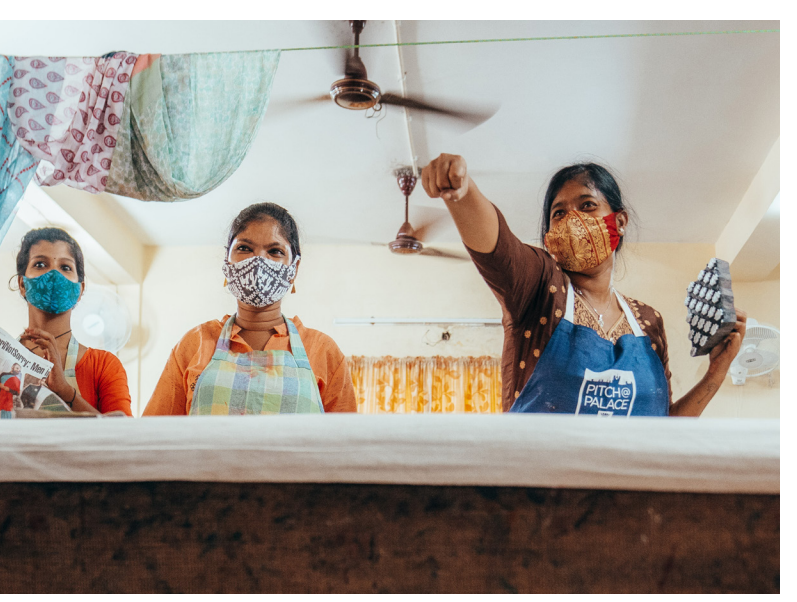
Block Printing - a skill traditionally practiced only by men