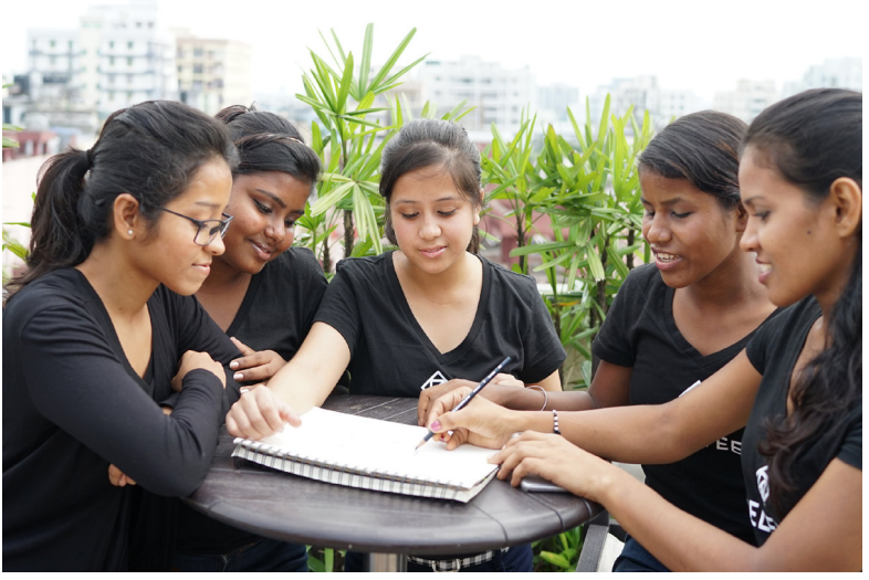
Life Skills Training - a critical part of all our vocational courses