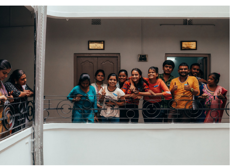
Computer Students at the HFC Learning Center