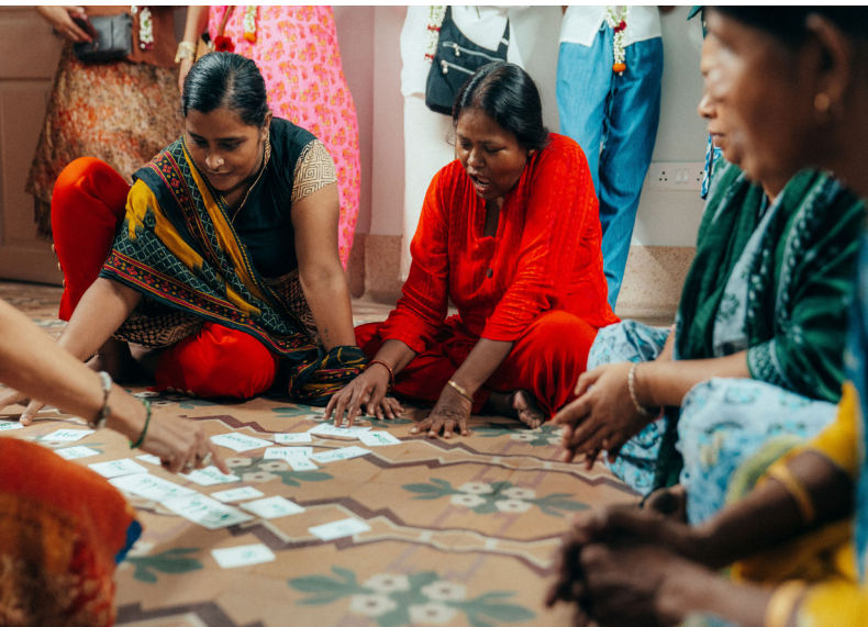
Adult Literacy Class