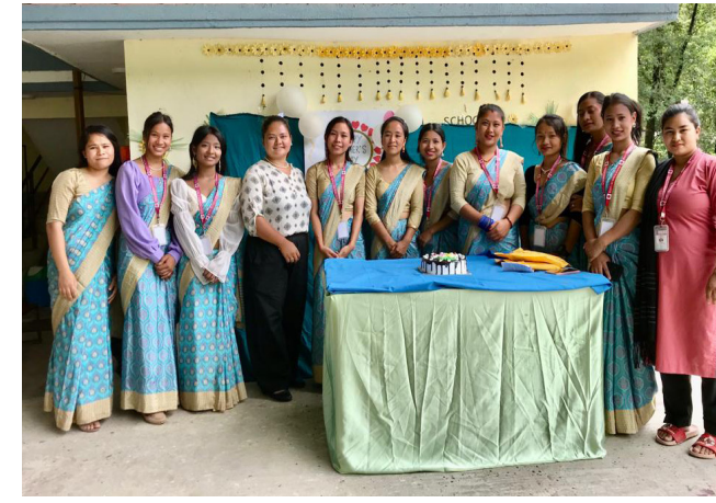
Freedom School Teachers

These pictures represent just a few of the hundreds of people - staff, partners, survivor-leaders, Board members and volunteers - who have made it possible for us to meaningfully impact the lives of 1200 women and children this year.