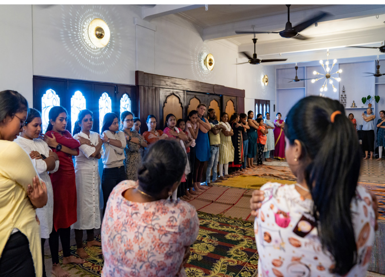
A photography and Dance Movement Therapy Workshop