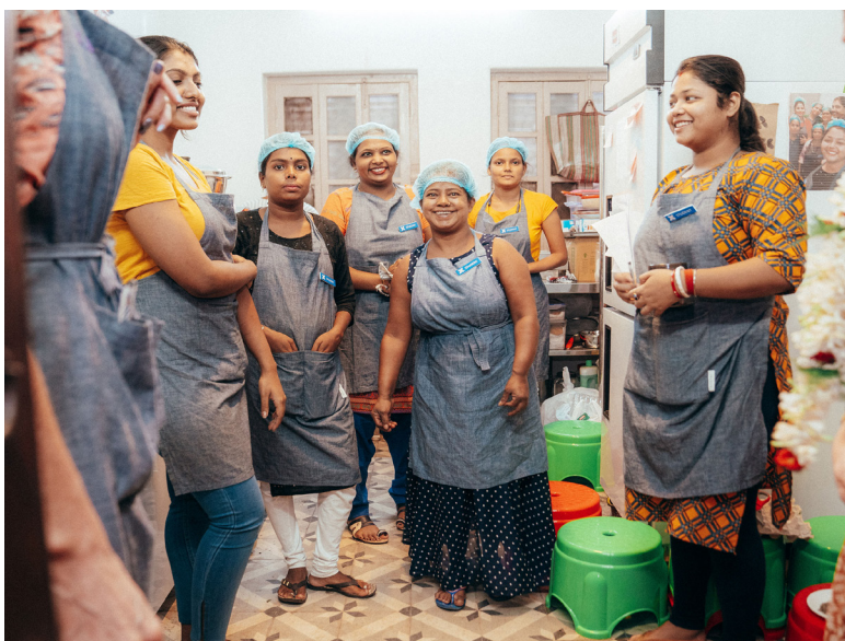
80% of graduates of the Bakery/Cafe Training found jobs in the field!

This program is a longtime favorite for our beneficiaries. It is evolving into a self-sustaining business managed by the artisans themselves.