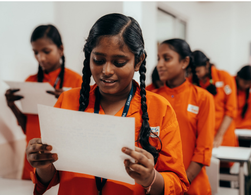
7th Graders at the Middle School doing a pen pals project

This new project, in collaboration with our long time local partners at Ek Tara, offers 275 girls from Kolkata's largest slum the means to break out of a vicious cycle of extreme poverty and high risk of exploitation.