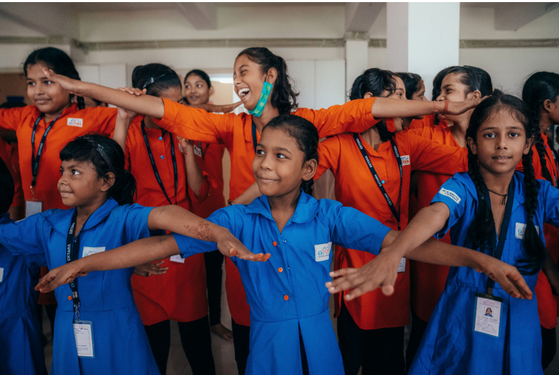
Hip Hop Class for Middle School and younger students at Ektara

At the Middle School, girls receive high quality education, a large variety of arts programming, sports, health check ups and nutritious meals. Parents are engaged in workshops and activities designed to enlist them as partners in their daughters' education and to become advocates for girls. Gradually, this community is transforming!