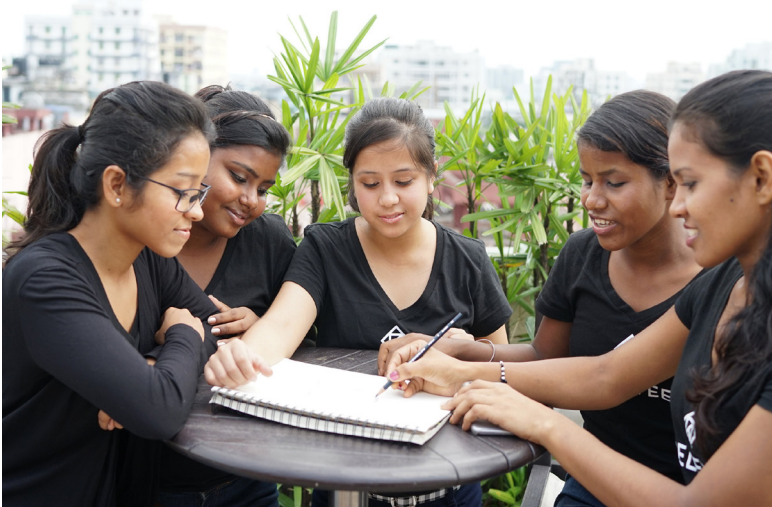
Life Skills Training - a critical part of all our vocational courses

Vocational Training, combined with life skills and financial literacy training, give women a pathway to become financially independent and less vulnerable to being exploited. They gain the power and agency to make choices for their own lives - often for the first time in their lives. Economic independence enables them to overcome stigma, move out of shelters, and support themselves and their children, breaking the cycle of poverty and intergenerational trafficking.