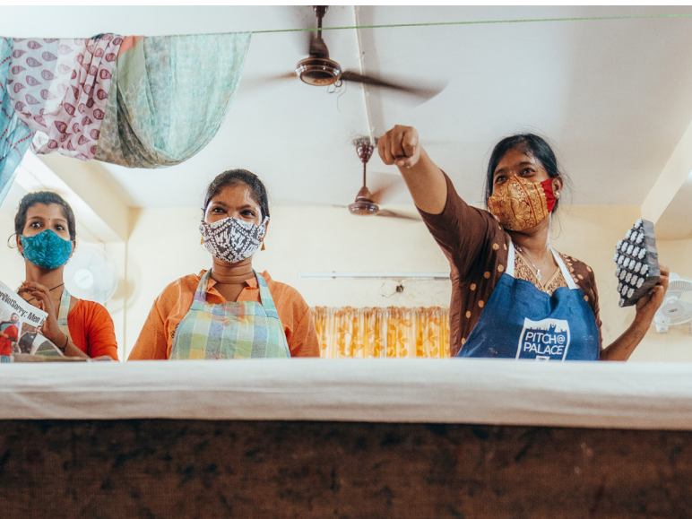
Block Printing - a skill traditionally practiced only by men

The women in this course had particularly high trauma and low educational backgrounds, so the course included remedial literacy and math. 80% of the trainees found employment in the field after graduation.