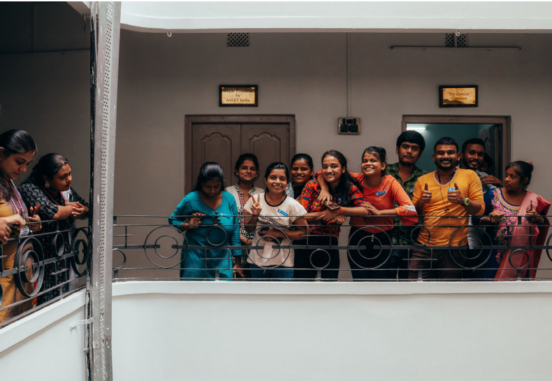
Computer Students at the HFC Learning Center