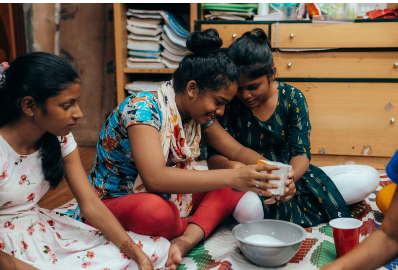
Science Workshop at the Resource Center